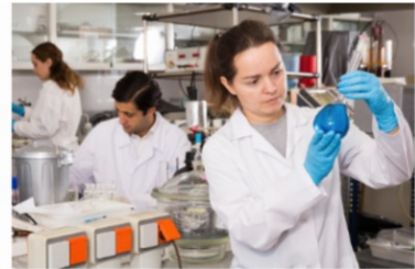
Clinical Lab Technicians