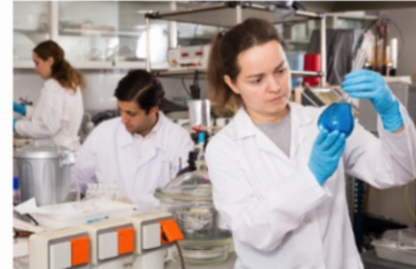
Clinical Lab Technicians