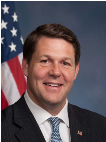
U.S. Rep. Jodey Arrington of Texas District 19

Early detection is key to beating cancer. That is why we need the Medicare Multi-Cancer Early Detection (MCED) Screening Coverage Act, sponsored by U.S. Rep. Jodey Arrington of Lubbock.