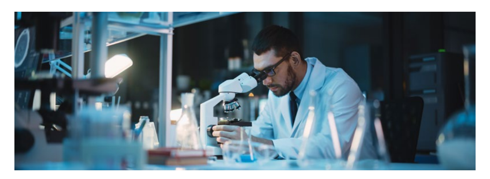
Figure 3. Texas biotechnology at a glance