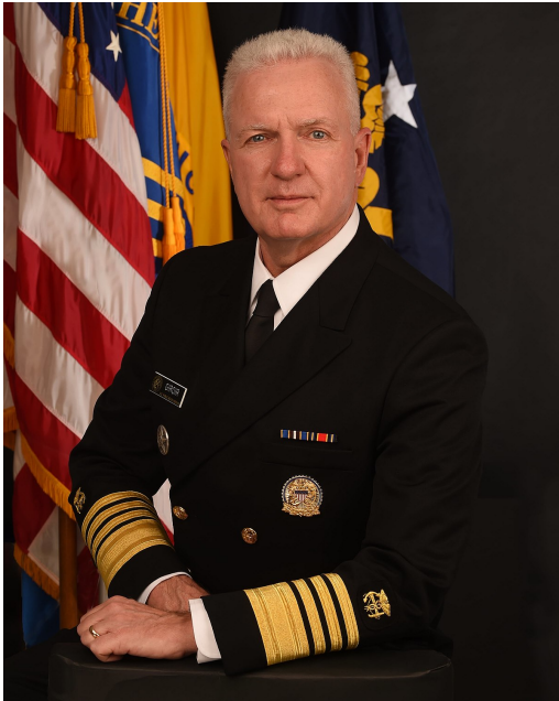
Admiral Brett P. Giroir, MD

Advancing novel technologies and transformational approaches within scientific research