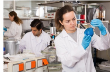
Clinical Lab Technicians