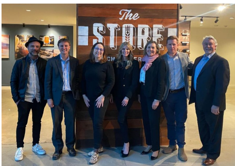
Some of the participants at the Rare Disease roundtable discussion.