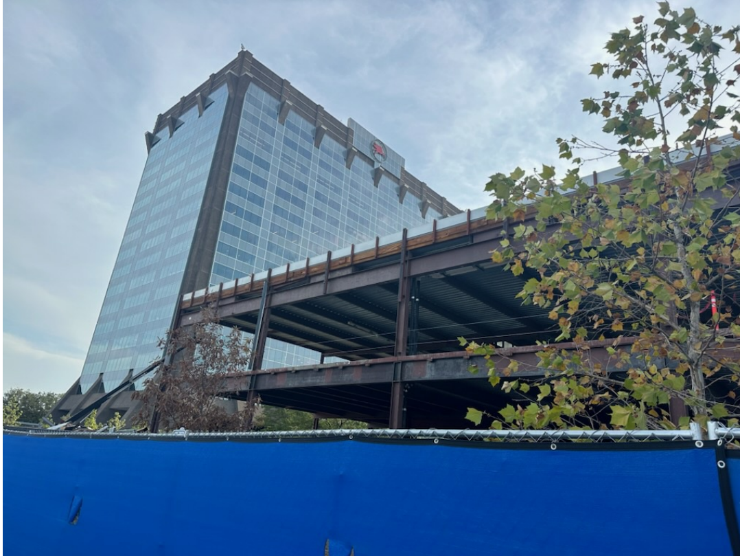
Bridge Labs expansion coming soon to Pegasus Park